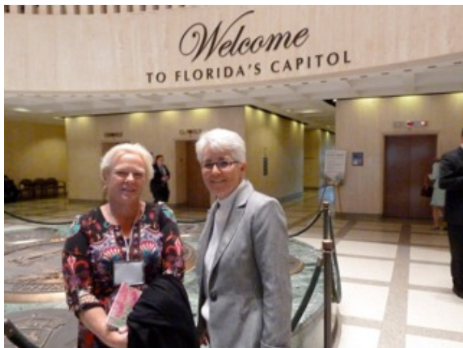
Ready, get set...lobbying with UU Legislative Ministry Feb 21-22 2012