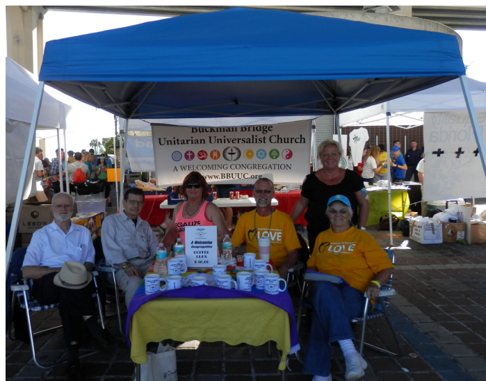
Welcoming Congregation Ministry Booth at River City Pride Festival 2012

“Let the beauty we love be what we do. There are hun- dreds of ways to kneel and kiss the ground.”