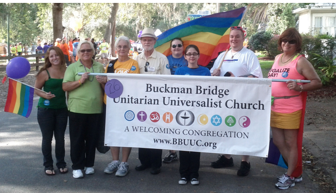
Welcoming Congregation Ministry at River City Pride Parade 2012